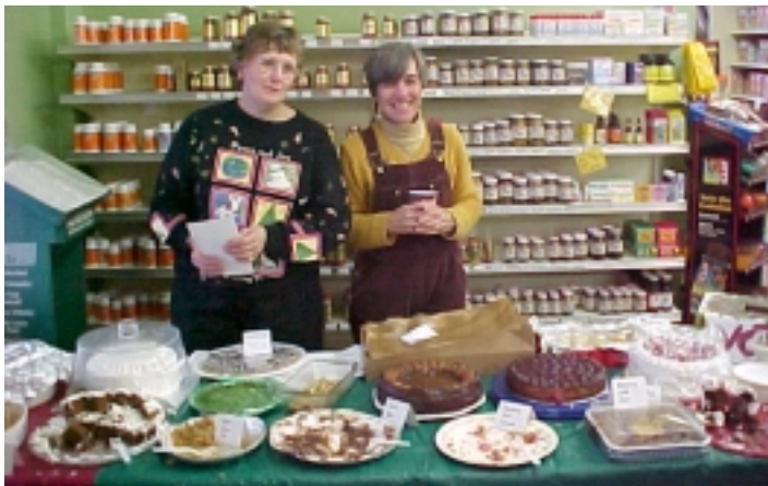
Co-op Volunteers look over the entries for Last Year's Bakeoff